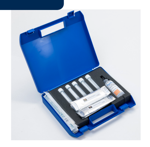
Swab Legionella Field Test™ Kit product code 56B006401

*The Centers for Disease Control and Prevention (CDC) is a federal agency that conducts and supports health promotion, prevention and preparedness activities in the United States, with the aim of improving overall public health.